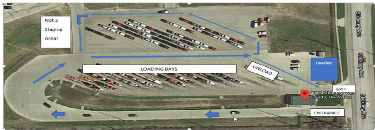
Nitro Creek Traffic Flow – South Pad 1.13.2021